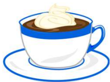
un chocolate caliente