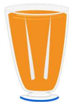
un zumo de naranja