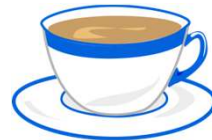
un café con leche