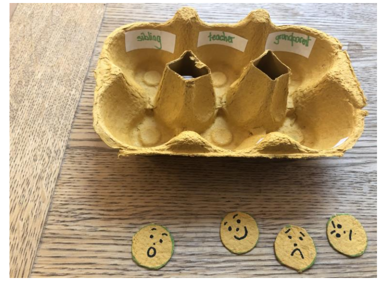
Note: You can also use flower pots or anything with various compartments instead of an egg box.

Step 5: Think of a time that Mum felt sad and try to think of what could have made her feel that way. Think of what you could do to cheer her up next time she is sad.